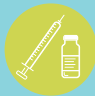
MEDICAL SUPPLY COVERAGE