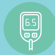
MEDICAL DEVICE & EQUIPMENT COVERAGE