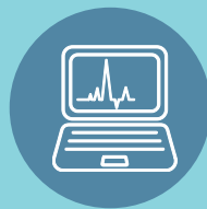
EDUCATION & TRAINING