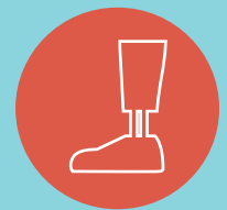
ARTIFICIAL LIMB COVERAGE